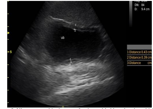
Figure 5 Ultrasonographic image of urinary bladder showing thickened bladder wall (white arrow),turbid content(blue arrow) with corrugated wall of urinary bladder with clear distinction of submucosa, muscularis and serosa indicating cystitis.