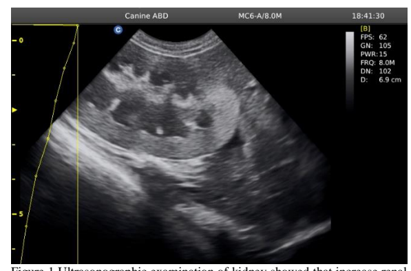
Figure 1 Ultrasonographic examination of kidney showed that increase renal cortical echogenicity(C) as compared to liver echogenicity(L) with poor corticomedullary definition indicating acute renal failure

diagnosis of urinary affections relies on a complete history, clinical signs, hematology, biochemical, urinalysis, and ultrasonographic examination of the urinary tract which become a routine practice in veterinary medicine and become the most frequently used technique in assessing canine pelvic and abdominal cavity (Nyland and Mattoon, 2014).