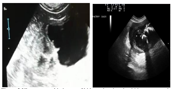
Figure 2 Ultrasonographic image of kidney showing that kidney appeared as sac filled with hypoechoic fluid with a rim of parenchyma remaining indicating hydronephrosis(A), loss of tissue architecture of kidney with loss of corticomedullary definition, dilatation of renal pelvis and dispersed hyperechoic content indicating hydronephrosis (B).